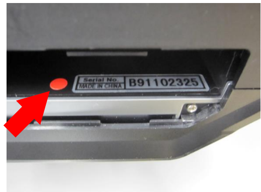
[Fig. 3] Display next to the serial number sticker