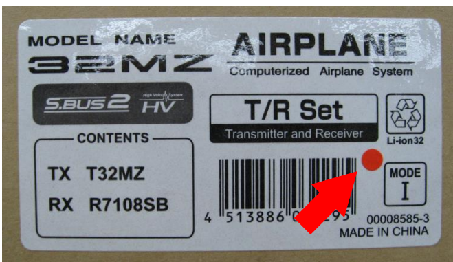
[Fig. 2] Display on the outer box label.

Products with a red circle sticker on the label attached to the outer box and next to the T32MZ serial number sticker are not applicable (inspected).